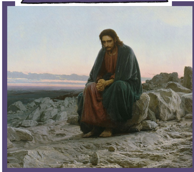
JESUS IN THE WILDERNESS

THOUGHT FOR THE DAY “Darkness comes. In the middle of it, the future looks blank. The temptation to quit is huge. Don't. You are in good company... You will argue with yourself that there is no way forward. But with God, nothing is impossible. He has more ropes and ladders and tunnels out of pits than you can conceive. Wait. Pray without ceasing. Hope.” John Piper